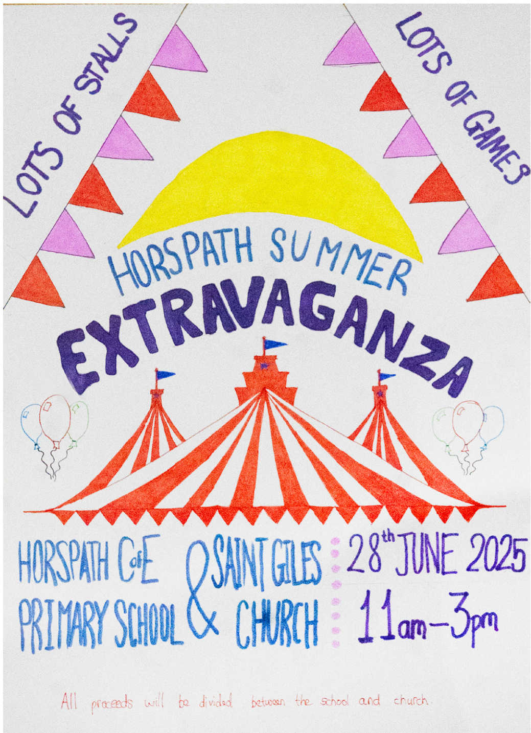
Poster designed and produced by Sophie Phillips aged 10